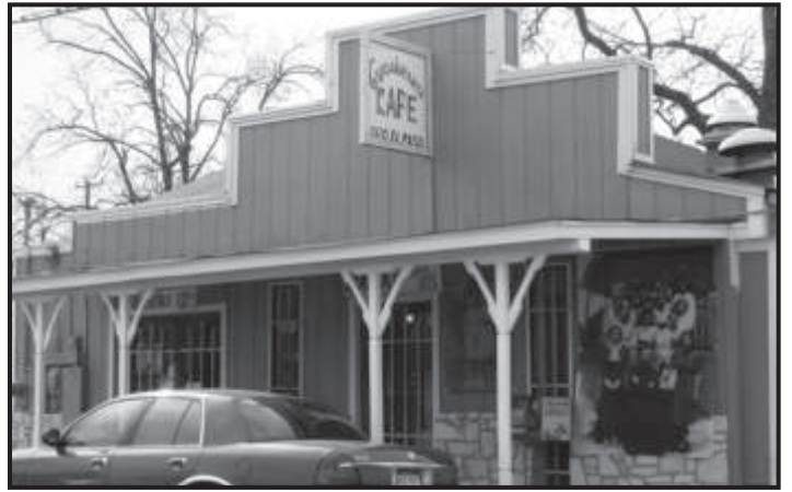
A West Side family business, the Guadalupanita Cafe, on El Paso St.

PTAs and local business-sponsored evenings might be places to gather narratives. Community leaders might help “translate” these narratives into concrete plans.