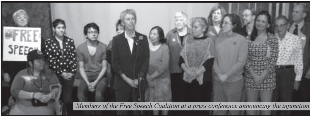
Members of the Free Speech Coalition at a press conference announcing the injunction.

ATTENTION VOZ READERS: If you have a correction you want to make on your mailing label please send it in to lavoz@esperanzacenter.org . If you do not wish to continue on the mailing list for whatever reason please notify us as well. La Voz is provided as a courtesy to people on the mailing list of the Esperanza Peace and Justice Center. The subscription rate is now $30 per year. The cost of producing and mailing La Voz has substantially increased and we need your help to keep it afloat. To help, send in your subscriptions, sign up as a monthly donor, or send in a donation to the Esperanza Peace and Justice Center. Thank you. -GAR