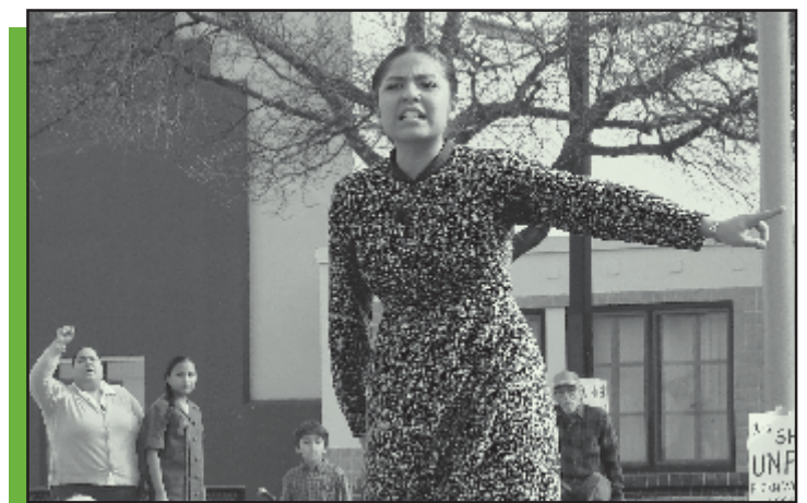
Scenes from An Altar for Emma performed at the Guadalupe Plaza on Sunday, March 2, 2008.